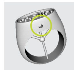
Hollow construction with drainage holes.