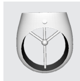
Fig.: Feeder/reservoir in casting

TIP: For the best possible casting results, it may be necessary to work with a feeder/reservoir in casting, to ensure subsequent metal supply in bulkier areas upon solidification of the metal.