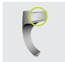
Hollow construction for voluminous objects.

In order to obtain an optimal printing and casting result, pronounced projections, corners and edges should be avoided during construction.